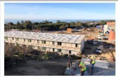
Building E + Overall Site