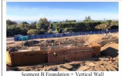
Segment B Foundation + Vertical Wall